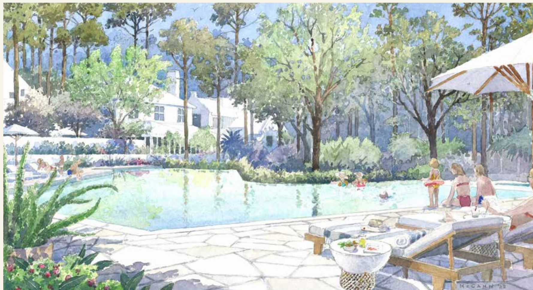
THE SILVA POOL AMENITY