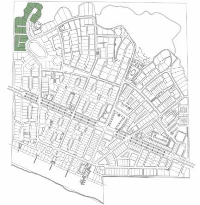
AREA OF DETAIL