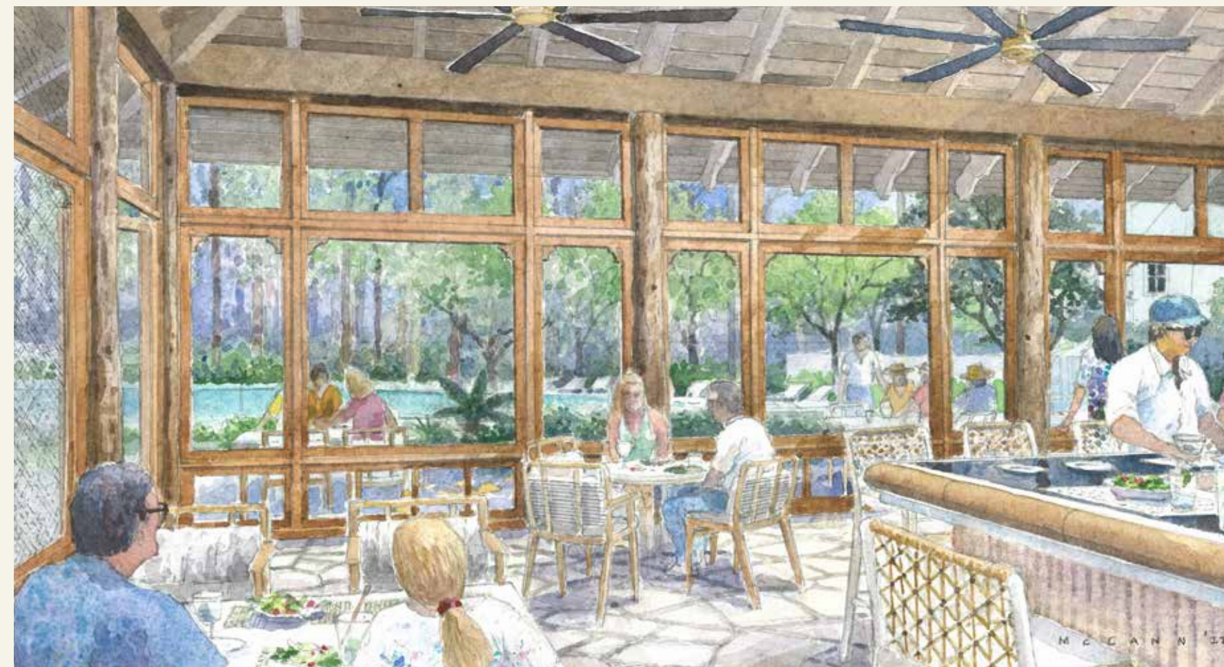
THE SILVA BAR & RESTAURANT