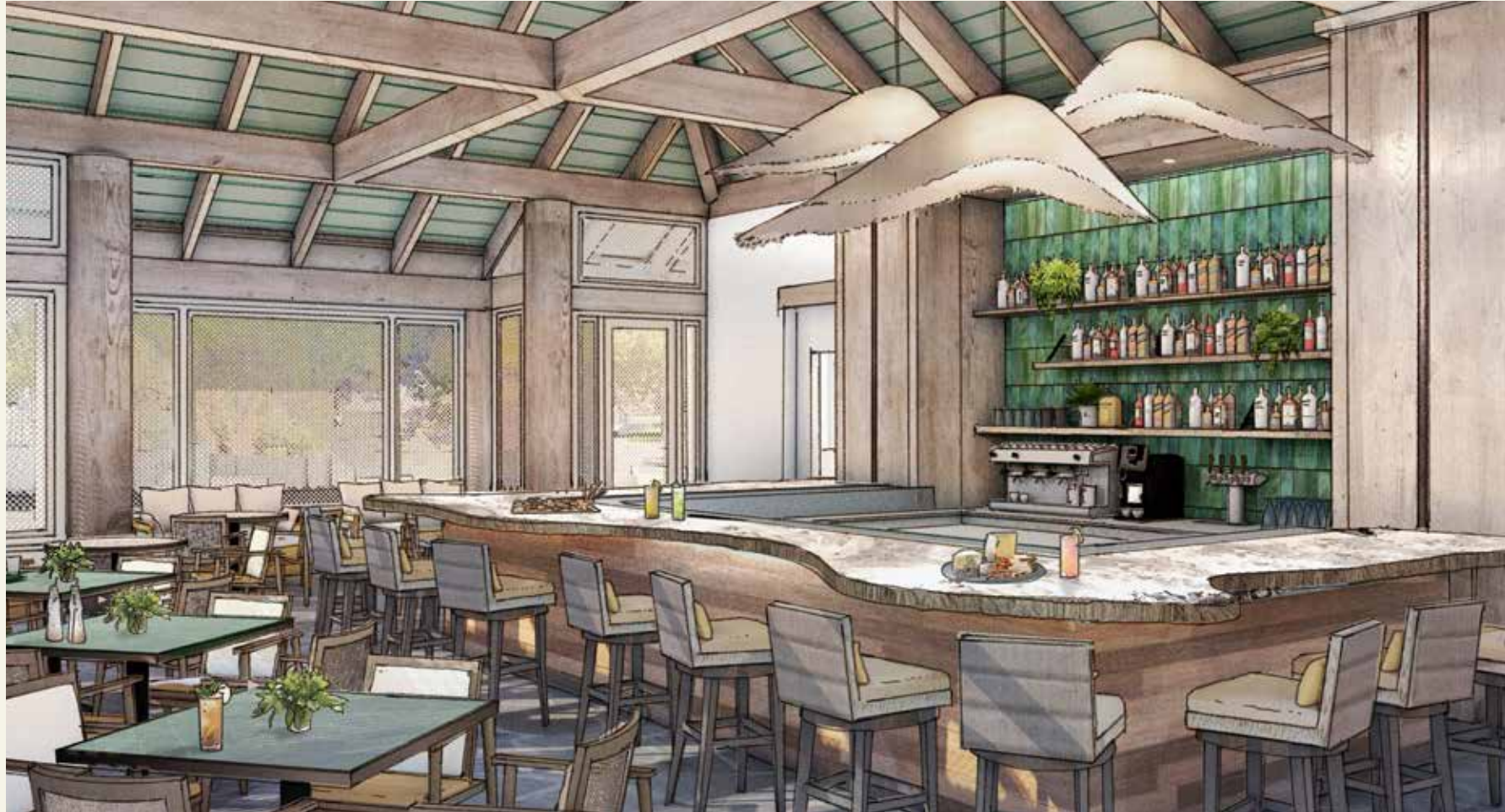
THE SILVA BAR & RESTAURANT