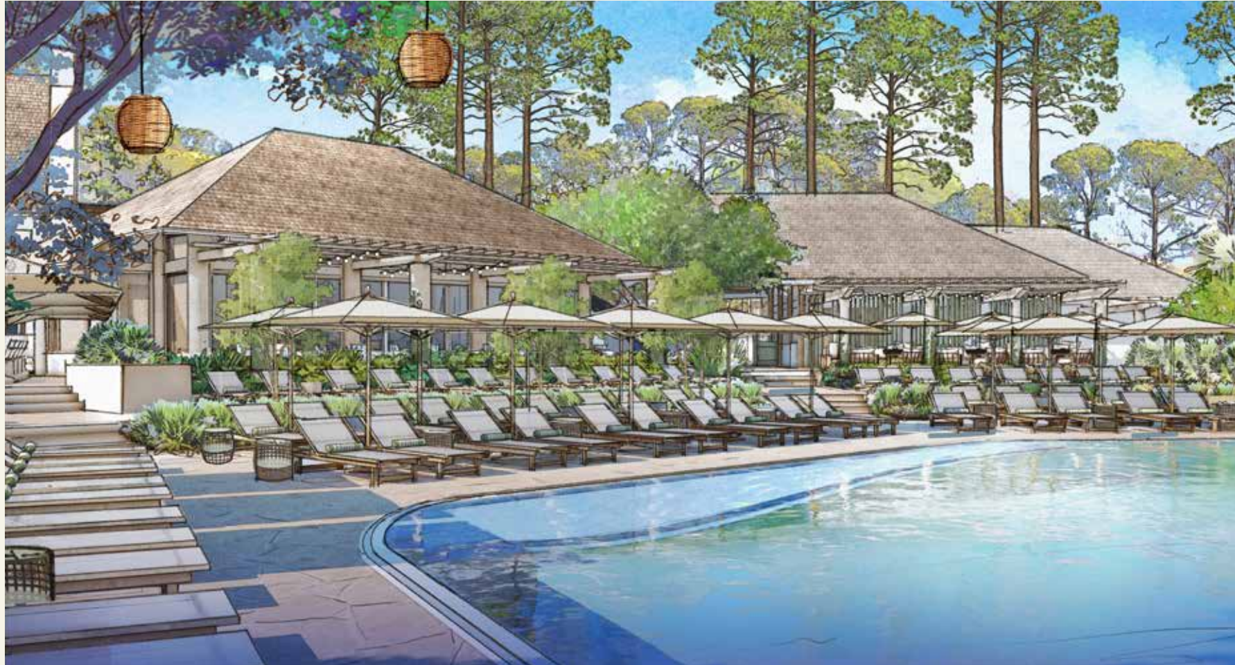
THE SILVA POOL AMENITY