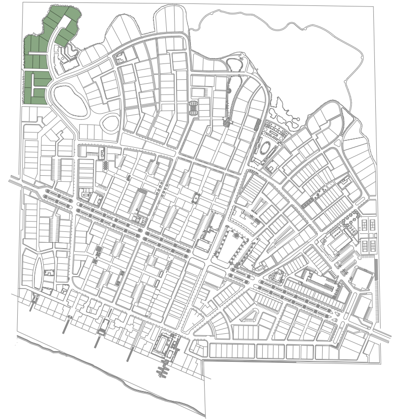
AREA OF DETAIL