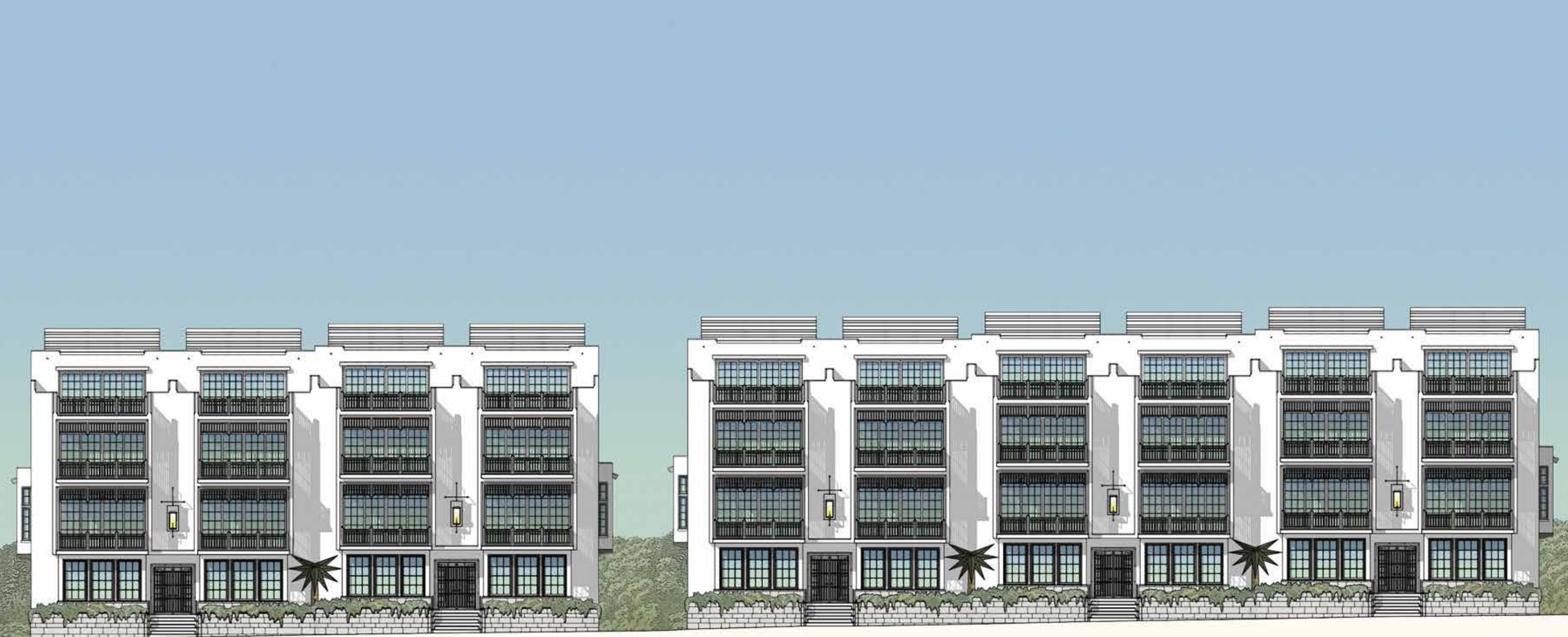
BUILDINGS 1 & 2